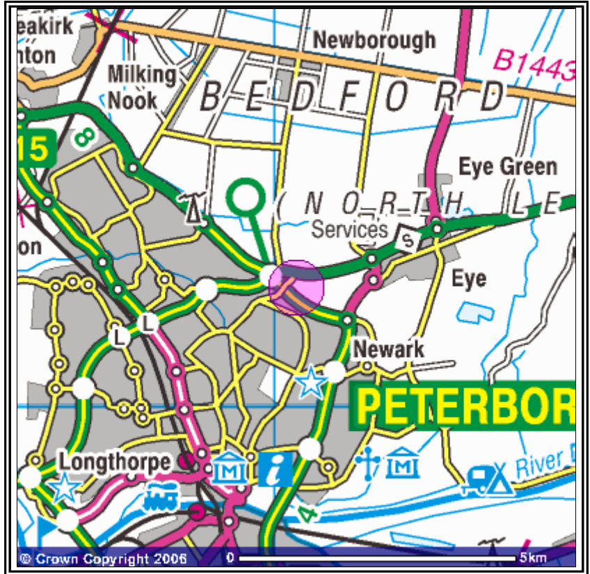
Image produced from the Ordnance Survey Get-a-map service. Image reproduced with kind permission of Ordnance Survey and Ordnance Survey of Northern Ireland .

Collection of mortar from Peterborough is welcomed